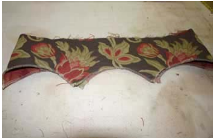
Serge or zigzag raw edges along the bottom