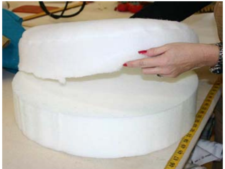
Slip the batting over the foam.