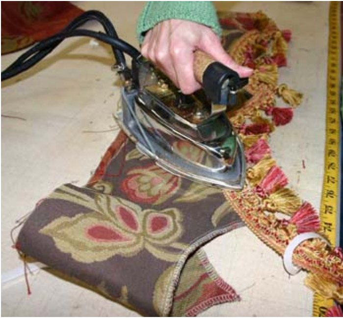
Attach decorative trim to the bottom of the points. We use a Steam-A-Seam2 to attach ours; however, you can hand stitch or glue the trim, if desired.