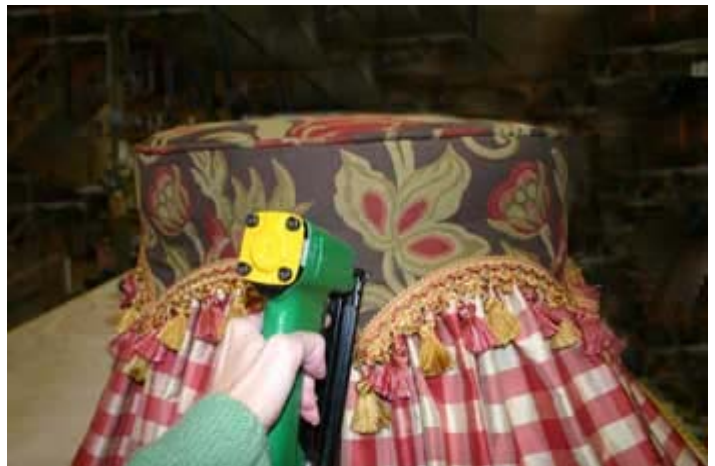
Turn stool right side up and slip the cushion top over the foam and stool base. Staple in place at the point where you will attach your button. In the Southern Lady Magazine, we used decorative nail heads all the way