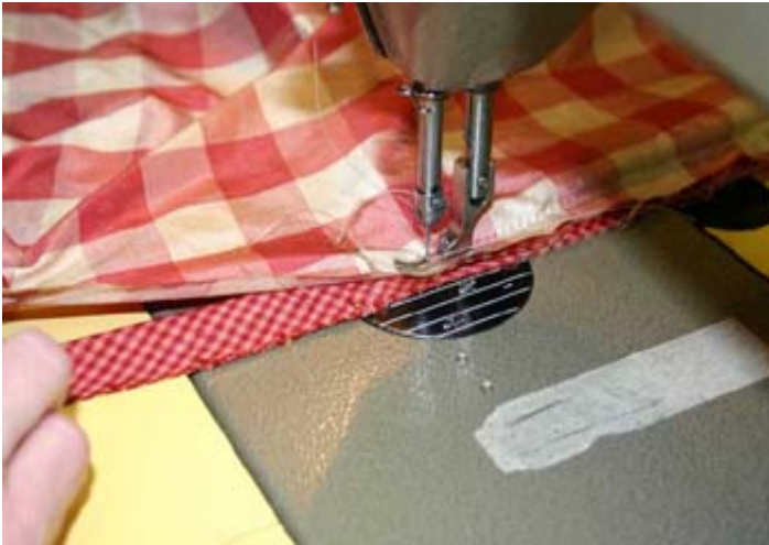
Stitch piping to the bottom of the skirt. See " Apply Piping Like a Pro " in the Tips & Techniques section of our website.