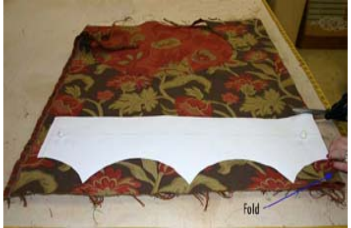
Using the pattern template shown at the beginning of this slide show, cut out the pointed band. Be sure to place the pattern on the fold. \frac{1}{2} " seam allowances are included on the pattern.