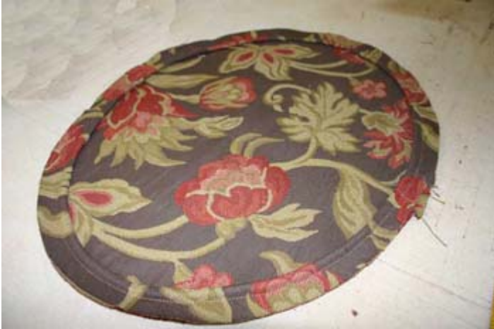
Sew the piping to the right side of the oval top.