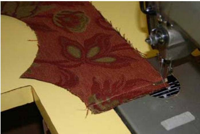
Joining short ends, right sides together, stitch, using a \frac{1}{2} " seam allowance.