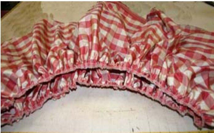
Gather the top of the skirt.