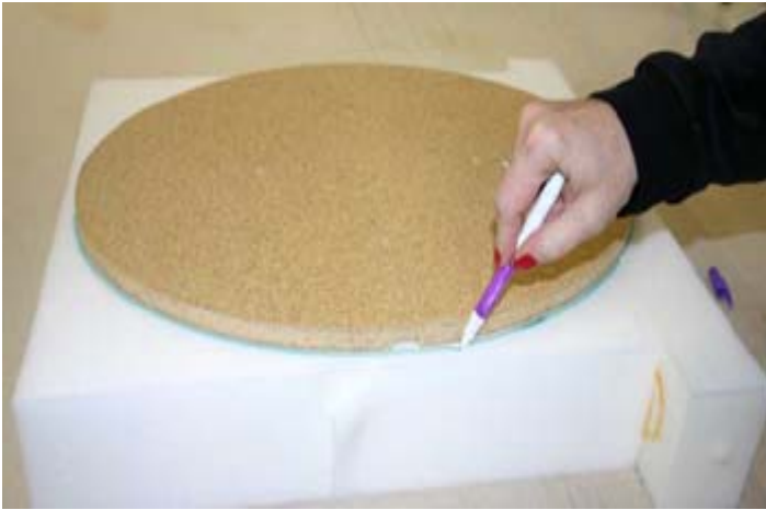
Using 4" thick foam, trace the oval shape of the base of stool onto the foam and cut. Cut-to-order foam is available from Textile Warehouse (1-800-281-9391).