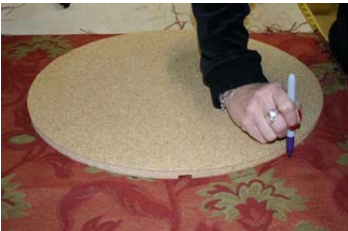
Using the stool base as a template, trace the shape onto the fabric. Add 1/2" to this measurement and draw another line.