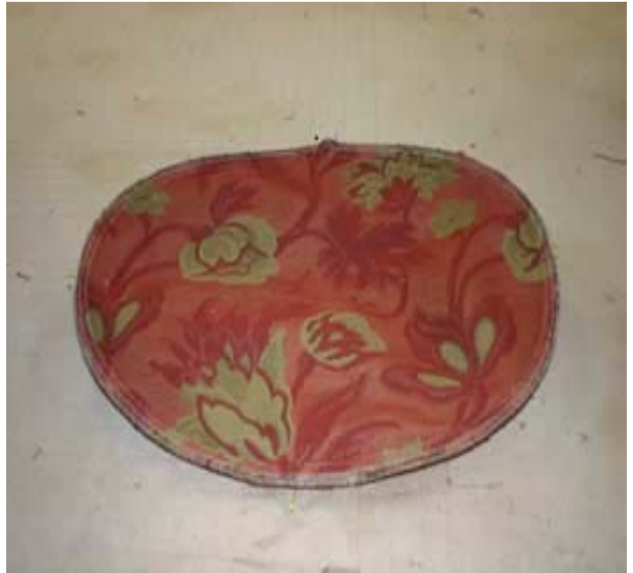
Divide the cushion top into 4ths and mark.