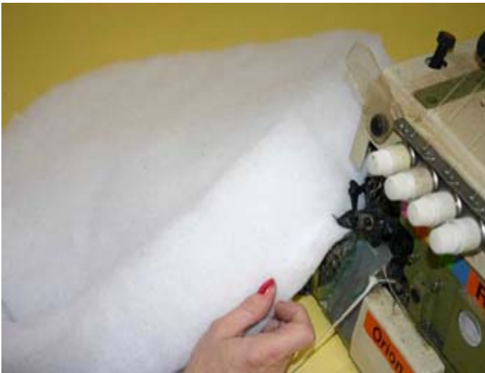
Serge or straight stitch the band to the cushion top.