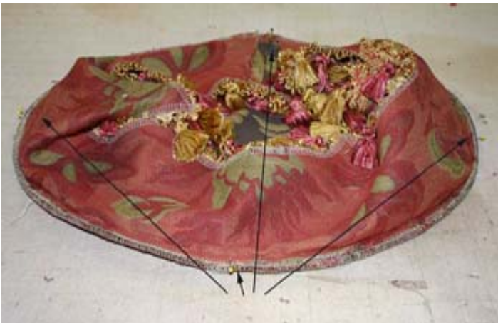
Divide the pointed band into 4ths and mark. Match the marks on the cushion top and the cushions sides and pin, right sides together. Stitch, using a \frac{1}{2} " seam allowance. Finish seams by serging, if desired.