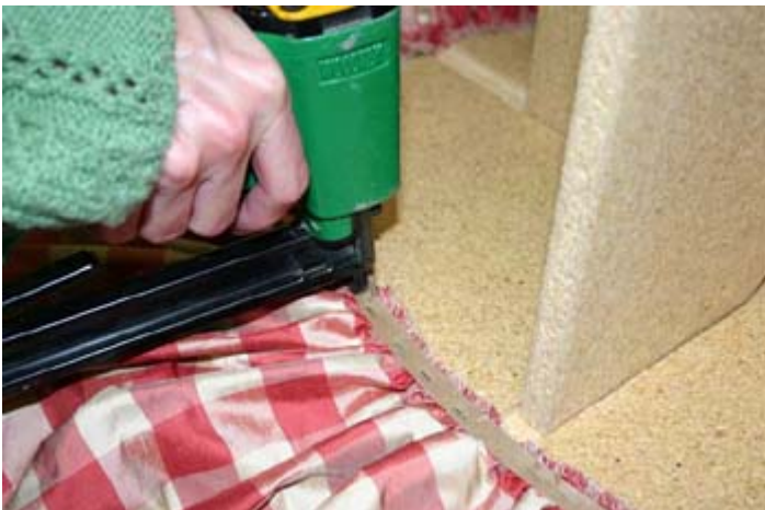
Staple cardboard tacking strip next, lining up the outer edge with the edge of the particle board. This gives you a rigid edge. Cardboard tacking strip is available at upholstery supply stores and at Textile Warehouse (1-