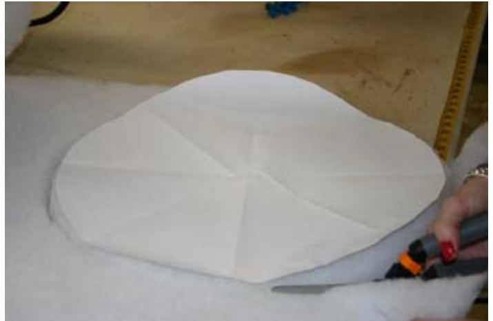
Take 1" batting and cut the oval shape of the stool base. Cut a 4" wide x 54-1/2" long band out of the batting. Batting is available from Textile Warehouse (1-800-281-9391).