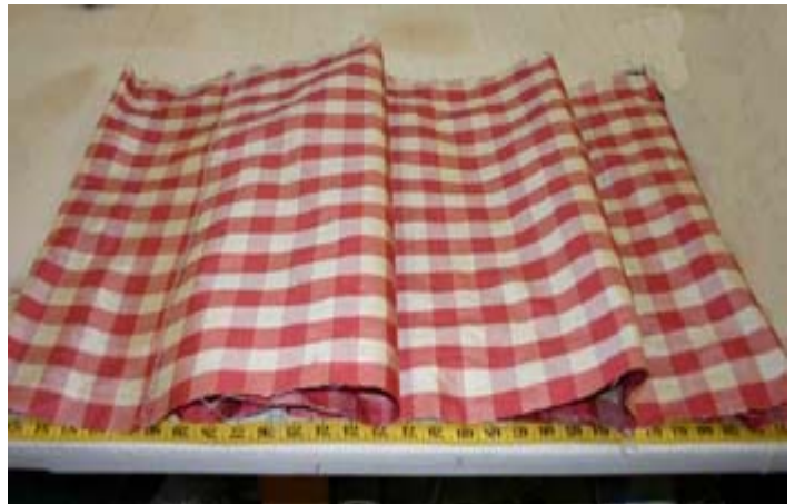
With right sides together, sew the 3 widths of the tuffet skirt using a \frac{1}{2} " seam allowance. Join all sides together forming one continuous piece. Finish the top of the skirt by serging or zigzagging