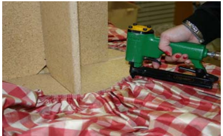
Turn the stool upside down and staple the gathered skirt as shown, right side down.