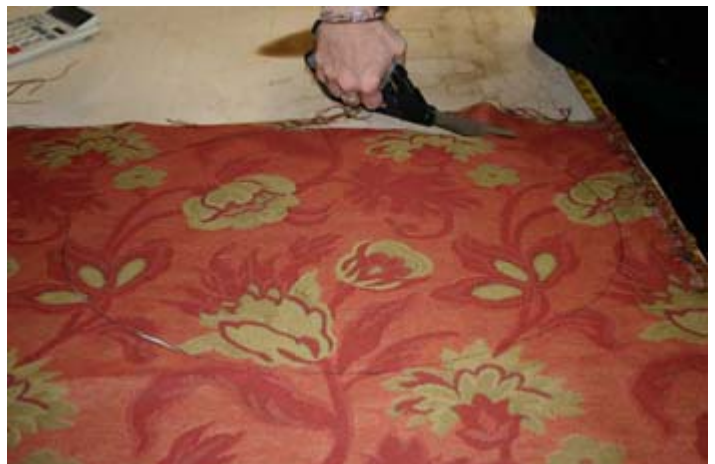
Cut the oval out of the fabric, using the outside line.